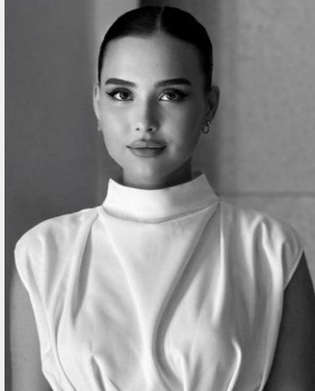
BILINGUAL HOSTESS AED 120/Hour