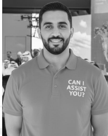
RUNNER AED 70/Hour