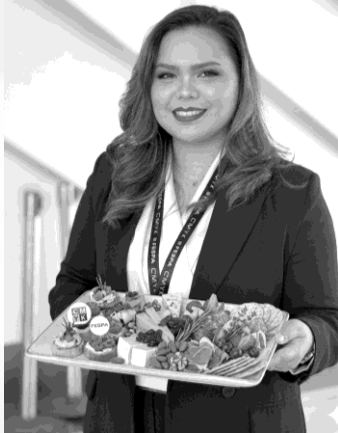
HOSPITALITY AED 70/Hour