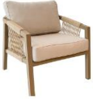
Aero Single Seater Sofa