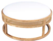
Como Round Ottoman