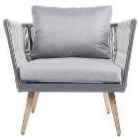
Mathilda Single Seater