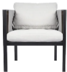
Bruno Single Seater