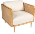
Amalfi Single Seater Sofa