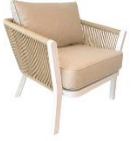
Abel Single Seater