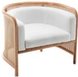
Como Single Seater