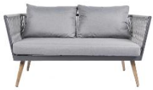
Mathilda Two Seater