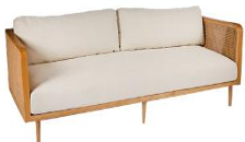
Amalfi Three Seater Sofa