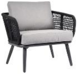
LyLia Single Seater