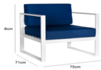
Troy Single Seat