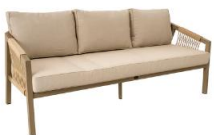
Aero Three Seater Sofa