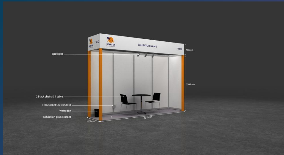
2 Sides Open