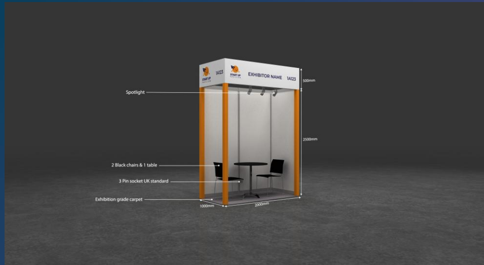
2 Sides Open