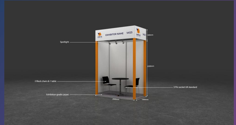
2 Sides Open