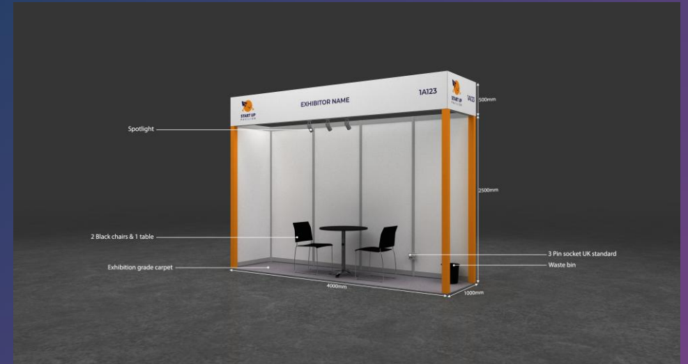
2 Sides Open