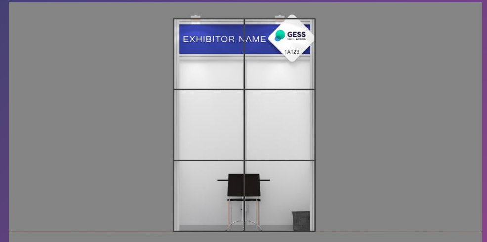
Grid – Front View

This document is strictly private, confidential and personal to its recipient(s) and should not be copied, distributed or reproduced in whole or in part, nor passed to any third party.